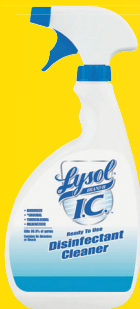
Chemicals & Janitorial

The products you need, ready when you need them.